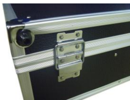
Reinforce Construction Hinges and Corner Protector

At the end of the course, the student uses the step-by-step illustrate destructions in the Experiment Manual to disassemble the trainer and prepare it for the next class