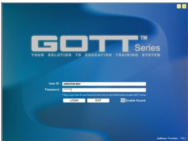
GOTT SERIES : COMPUTER BASED TRAINING SYSTEM (CBT)